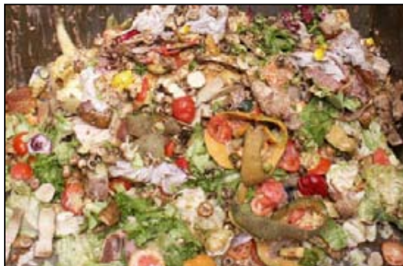
Figure 3. This post-consumer food waste will produce energy and a soil amendment when anaerobically digested and then composted.

• Performance contracting is one way to pay for the infrastructure upgrades needed to implement anaerobic digestion at a wastewater treatment facility.